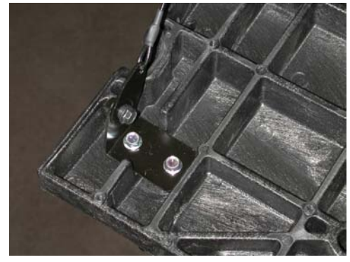
Manual # 650261

3. Remove the tailgate strap from the side you are working on. Remove the (2) 10MM bolts holding the strap bracket to the latch. Use the same bracket and bolts to install the new latch, reinstall the strap.