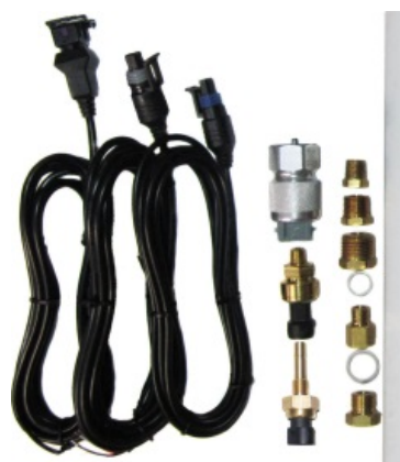
Universal Sensor Pack