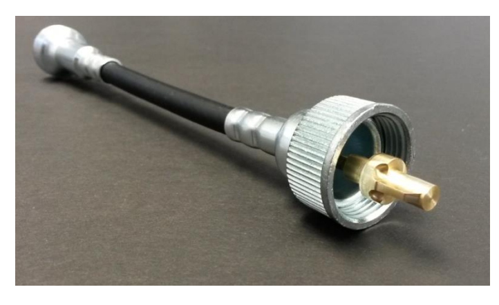
7/8" thread-end of cable assembled with brass tang