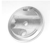
Back plate removed (attached to the assembly)