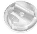
Back plate for '75-'76 Caprice (packaged separately)