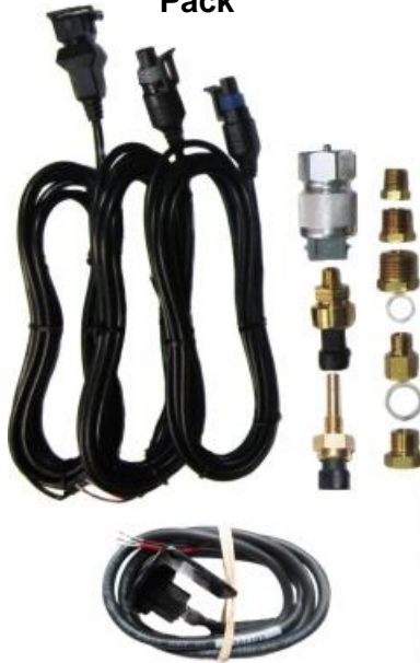
Universal Sender Pack