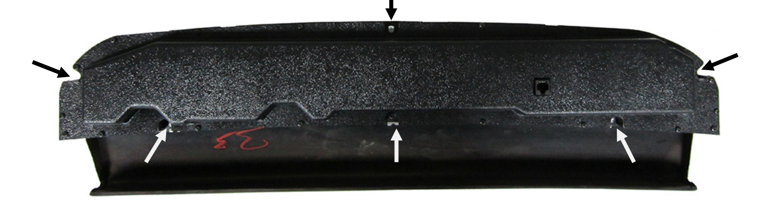
Screw, lock washer, and hex nut

3b. Secure the gauge to the bezel using the five stock screws and the provided screw, lock washer, and hex nut.