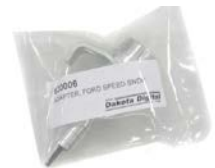
Ford Speed Adapter