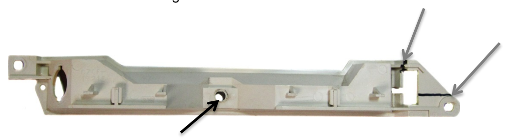
10-32 X 1/4" Screw used here

On 1967 models with a back lit heater control, you will have to modify the light housing to fit. Perform two cuts shown below and use the provided 10-32 X ¼" screw for the center mounting to the VHX bezel.