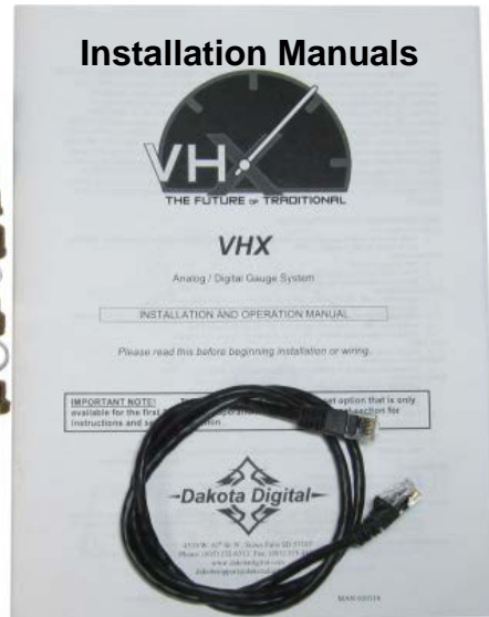
(2) 36" CAT5 Cable's