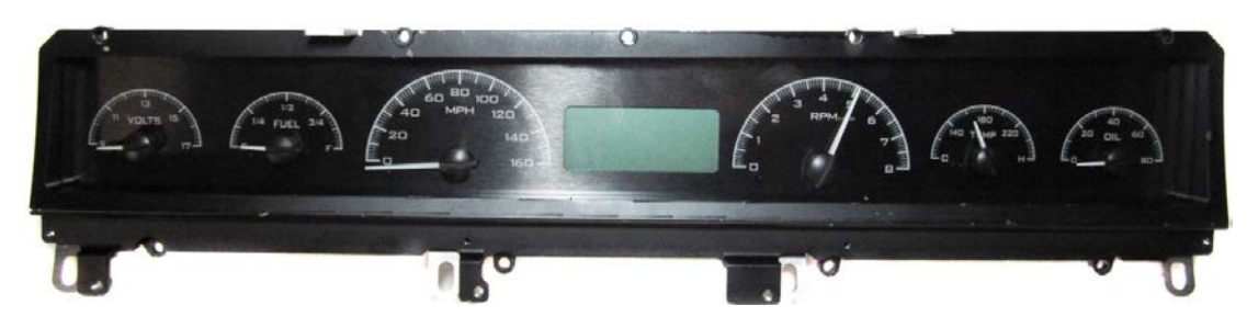
Universal Sender Pack

Your new VHX-68D-STD kit includes: VHX Display