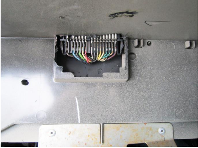
Manual # 650602C