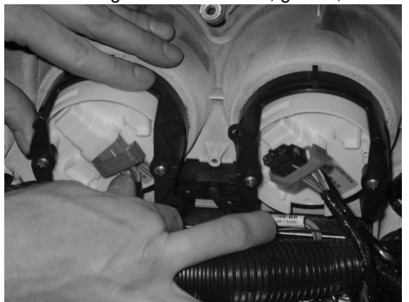
Unplug the factory tachometer

Unplug the tachometer. Remove the screws securing the clamp that holds the gauge in place and pull it out through the front of the fairing. Save the screws, gasket, and clamp to be reused when you install the new Dakota Digital gauge.