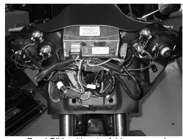
Road Glide with outer fairing removed