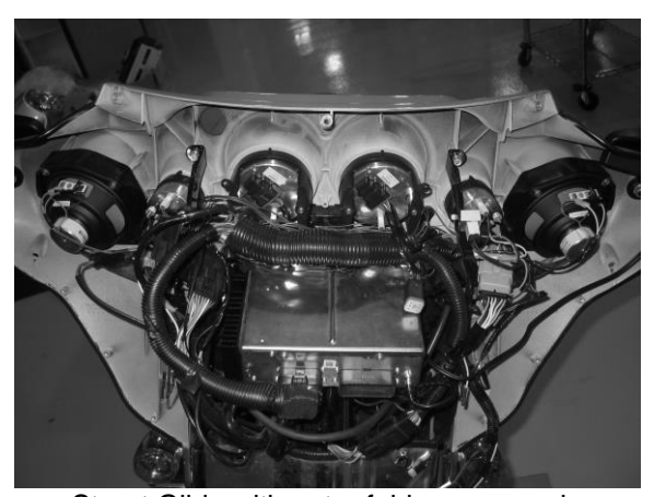
Street Glide with outer fairing removed

Remove the outer fairing; this will vary from model to model, so please follow the service manual to expose the wiring and gauges. Don't be alarmed by the amount of wires behind the fairing, this is a direct plug in gauge and these detailed instructions will guide you through it.