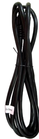
72" Clock Harness