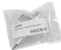
Ford Sender Adaptor