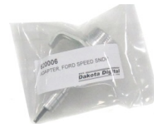
Ford Speed Adapter