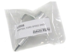
Ford speed sender adaptor