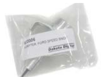
Ford Speed Sender