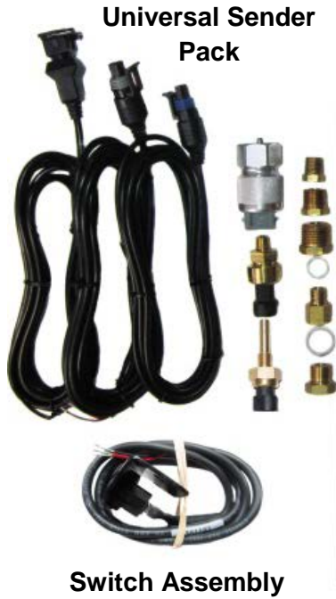
Universal Sender Pack