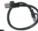
12" CAT5 Cable