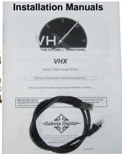
36" CAT5 Cable