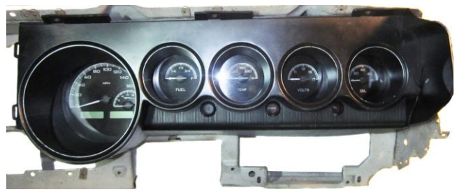
Indicators are stepped