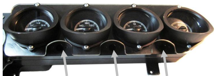
Indicator light guides are removed