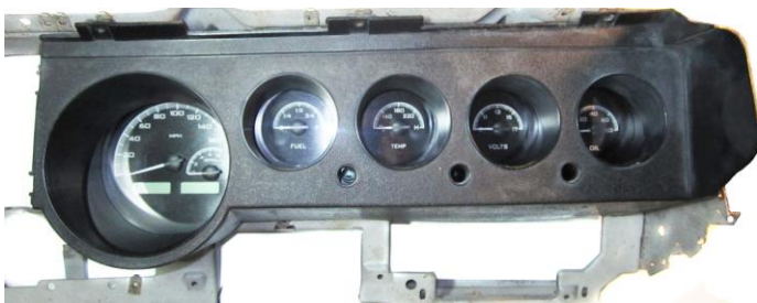
Indicators are flush

5. Determine which gauge bezel you have based on year and/or model; a bezel that has the indicator face flush to the front of the bezel or a bezel that has a step where the indicators are recessed from the front of the bezel. If you have the stepped bezel you will need to remove the three (3) indicator light guides by removing the two (2) small phillip screws on each light guide. Re-install the gauge bezel to the dash using the factory hardware and refer to the main manual for wiring instructions to complete the VHX installation.