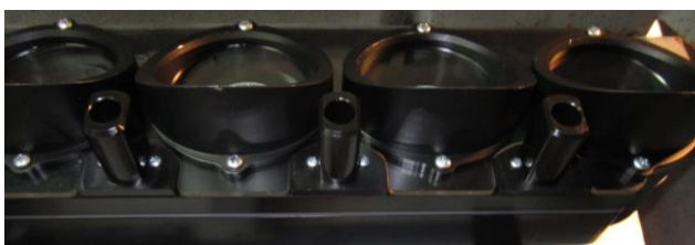
Indicator light guides remain