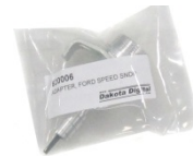
Ford Speed Adapter